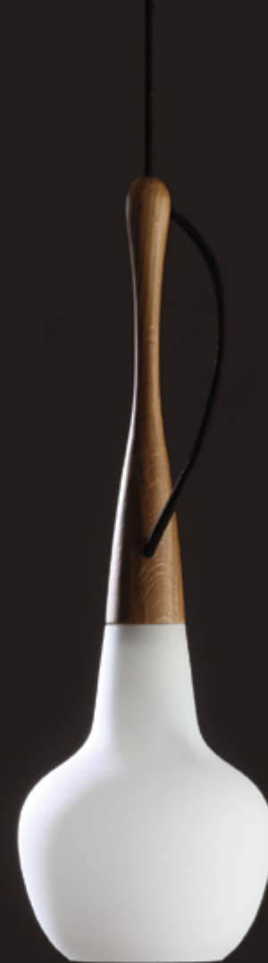
N° 11.100 / La Torche CM Vintage opal glass