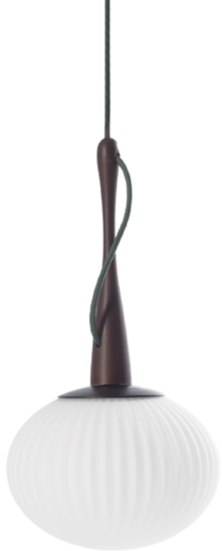
N° 11.022 / La Torche CM Pleated opal glass