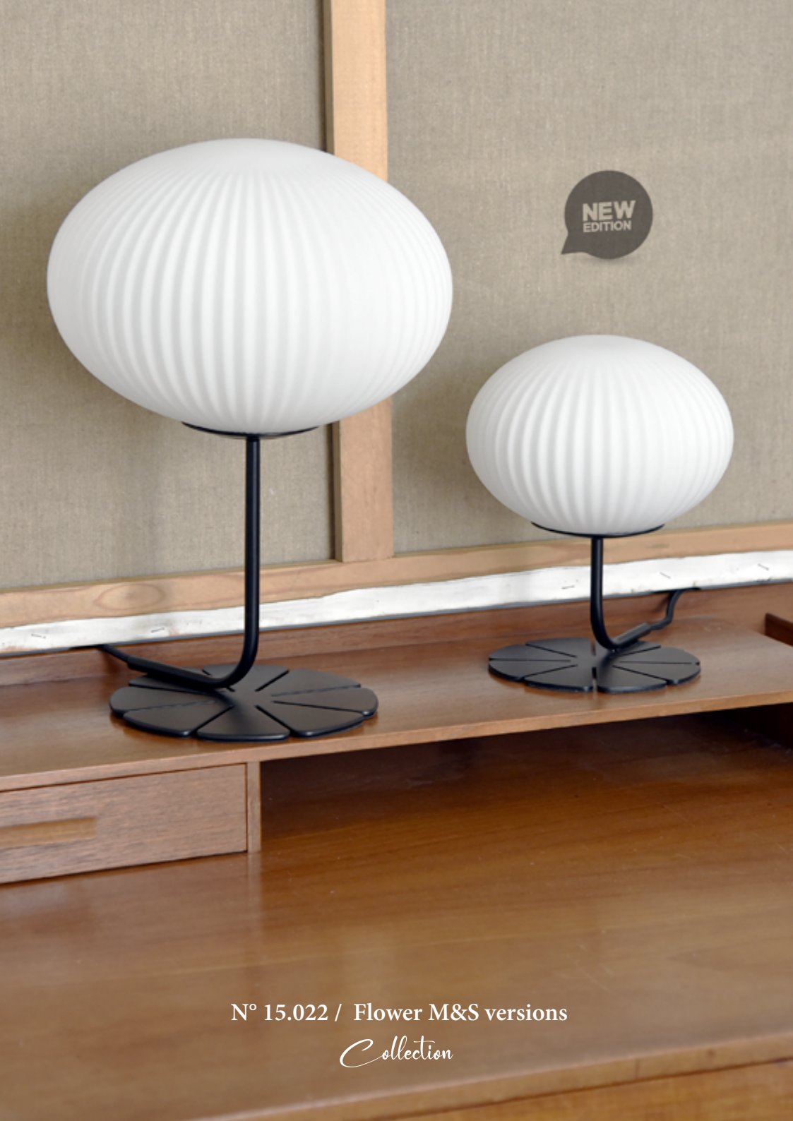
N° 15.022 / Flower M&S versions Collection