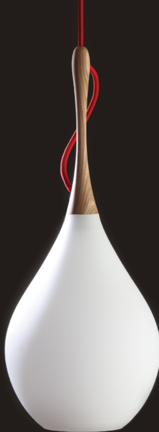
N° 11.110 / La Goutte