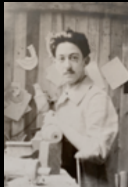
Georges Rispal 1925