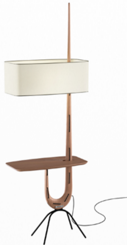
14.952 Girafe à tablette coming soon