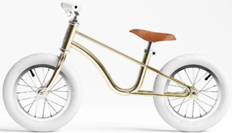
Balance bike, limited edition Rispal X Banwood