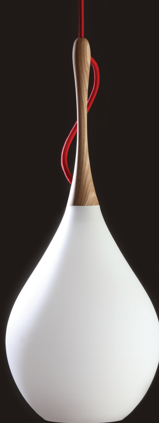
N° 11.110 / La Goutte