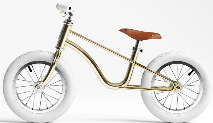
Balance bike, limited edition Rispoli X Banwood