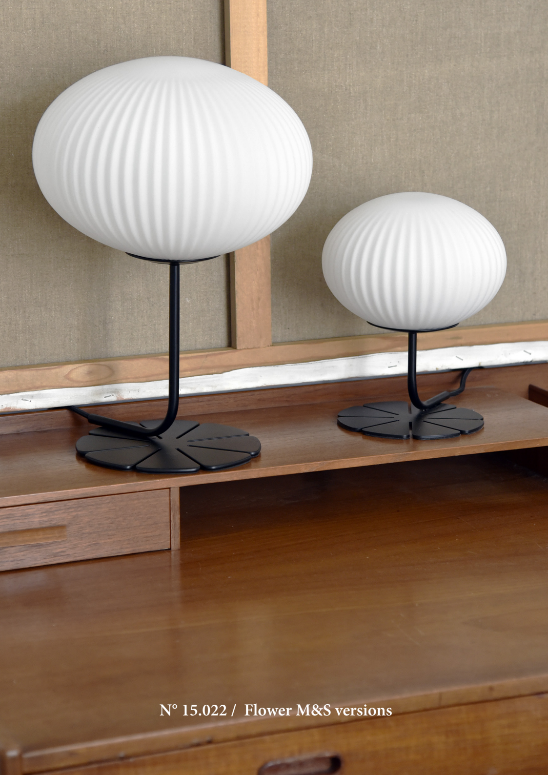
N° 15.022 / Flower M&S versions