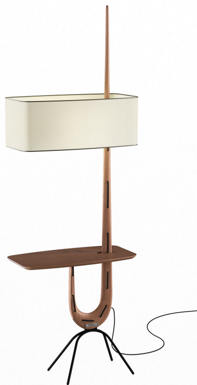
14.952 Girafe à tablette coming soon