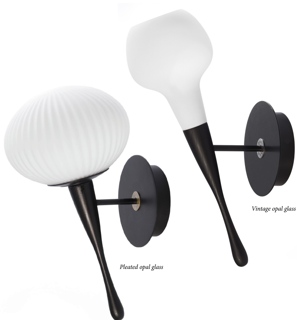
Pleated opal glass