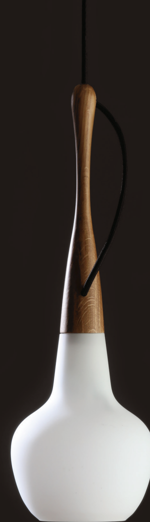
N° 11.100 / La Torche CM Vintage opal glass