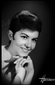
Georgette Rispal 1963