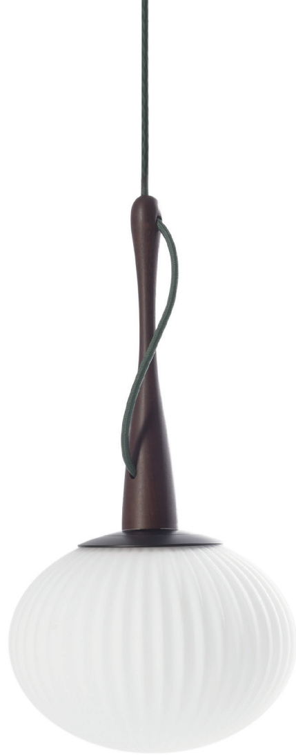
N° 11.022 / La Torche CM Pleated opal glass