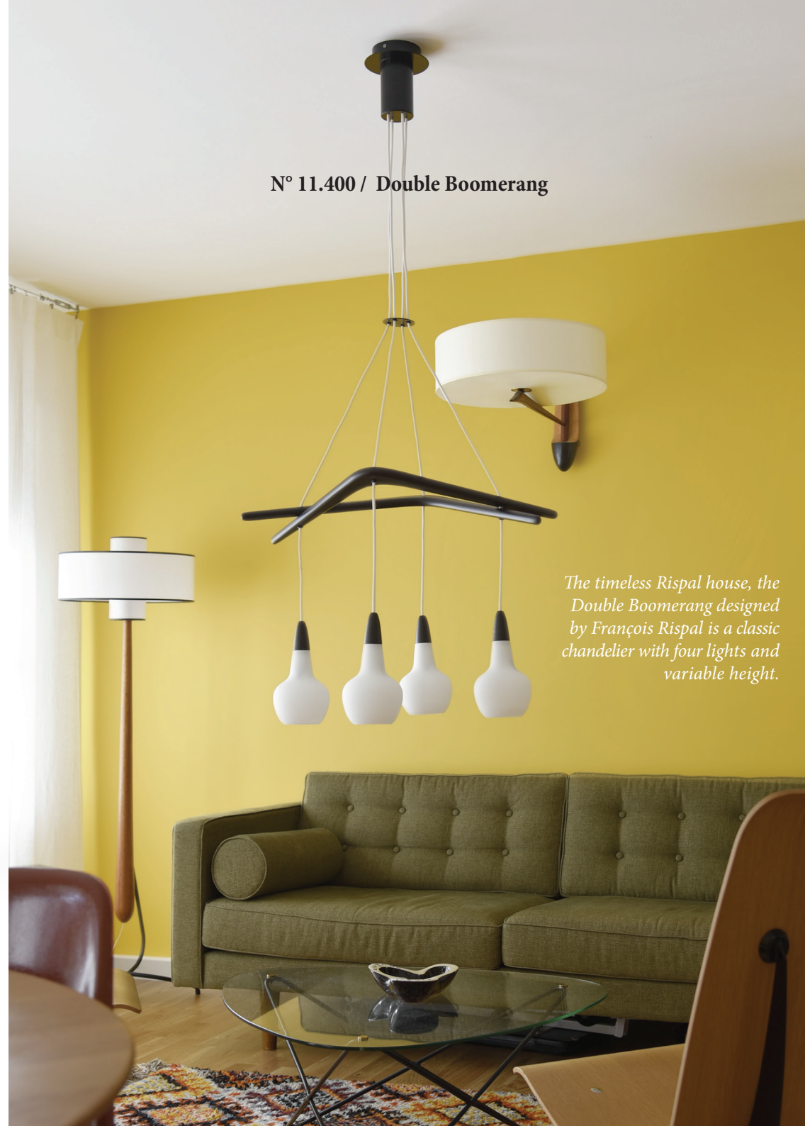
N° 11.400 / Double Boomerang

The timeless Rispal house, the Double Boomerang designed by François Rispal is a classic chandelier with four lights and variable height.