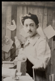
Georges Rispal 1925